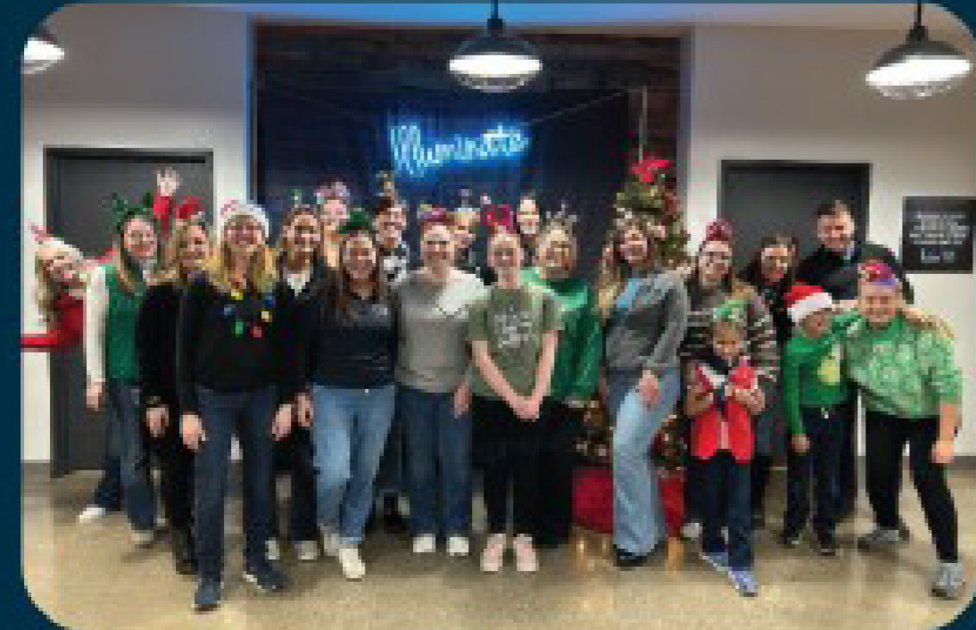
Special Needs Adult Program (SNAP) Holiday Dinner

Proud to give back and support our community!