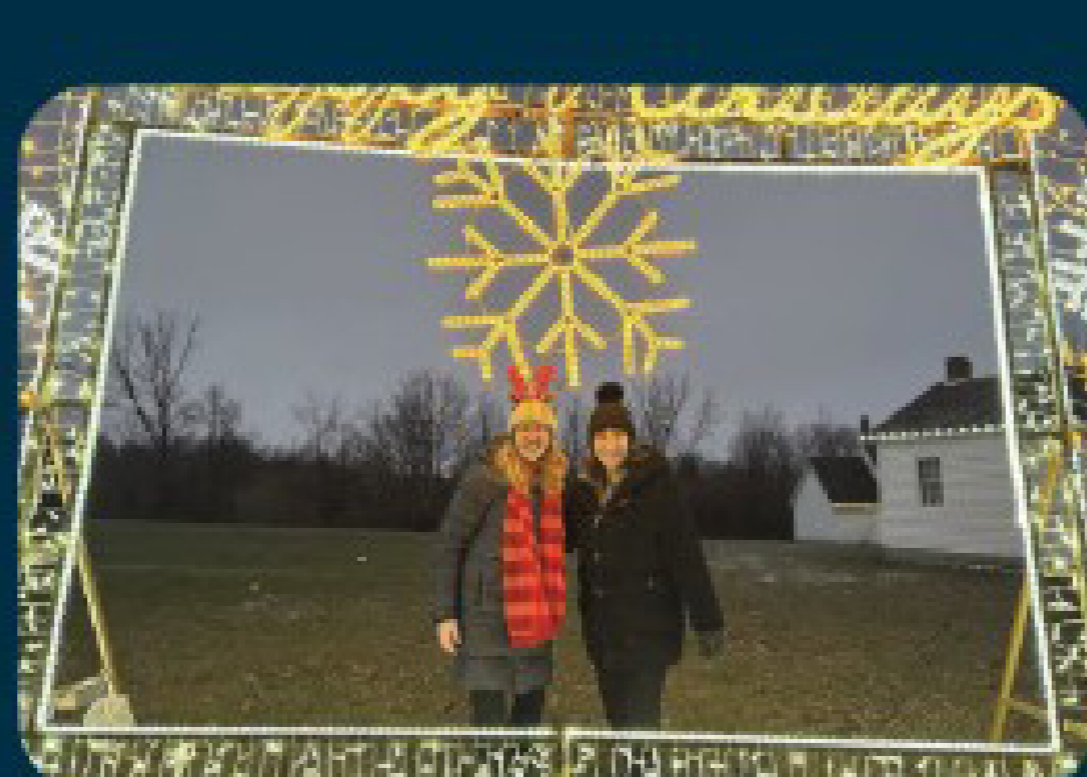
Livonia-Westland Chamber of Commerce Night of Lights