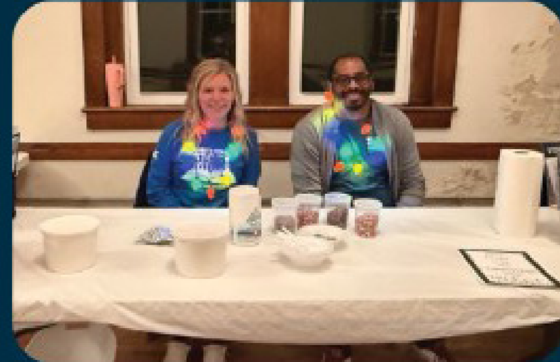
Parma's Christmas in the Village